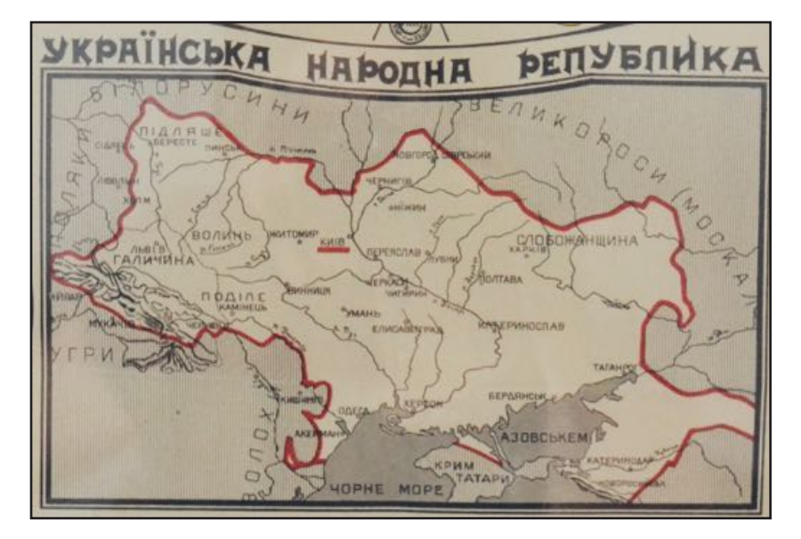
Ukrainian Lands following the Act of the Union of 1922.

Province of the Ukrainian National Republic. But, because of the political and wartime situation, both governments continued to work separately, retaining its own governmental structure due to the fact that it had different obstacles to overcome and different enemies to fight. The ZUNR government had its own Ukrainian Galician Army, but for additional military readiness and protection, it proclaimed general mobilization. As part of the military force, the Galician Army, also formed its own aviation regiment.